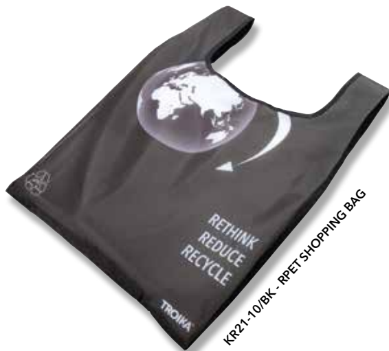
KR21-10/BK - RPET SHOPPING BAG